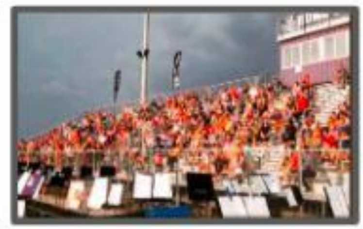
Our Community came out to support our band and athletics at Picate Community Night!