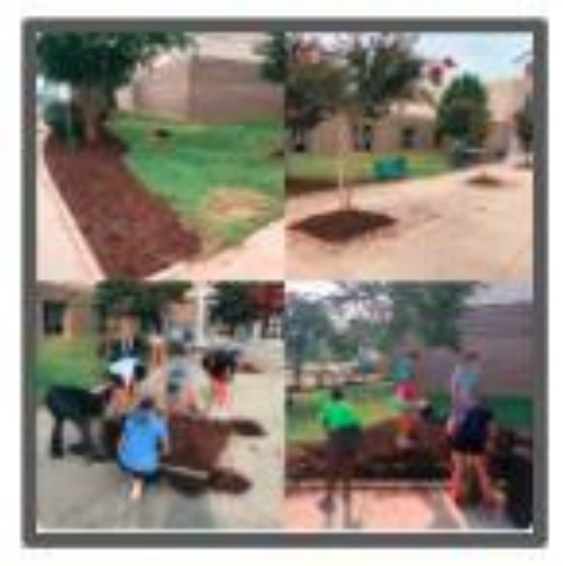
Students, Parents, and Staff Indped in our very successful campus beautification day!